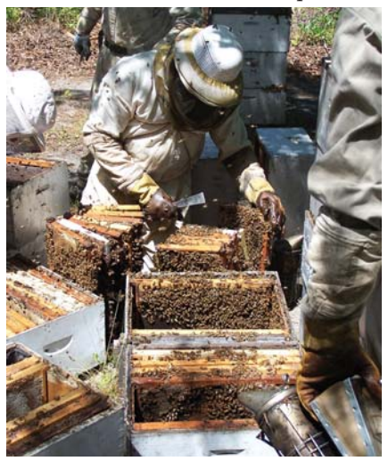
Finding the queen in a big colony can be a challenge.

Now, let's go back to the parent colony. Make sure to leave behind plenty of nurse bees, a frame of eggs or very young larvae, honey and pollen; this colony is now queenless and will need to raise its own queen. If