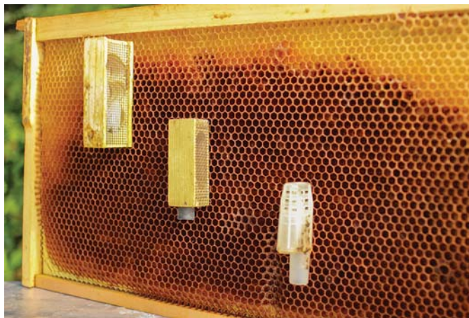
The three most popular queen cages.

Unfortunately, this year wasn’t much better than the year before. Predictably, we spent time wrestling with the introductions of 300 queens. Then the time spent on checking them, requeening when most ended up failing again, and dealing with the unavoidable side-effects such as laying workers, which all contributed to a huge mess and blown project schedules. Regarding the material cost, it’s not just the price of the queens that went down the drain. There is only so much brood available in our healthy hives to set up nucs. Then, if we have to re-supply brood to failing nucs during re-queening, it is very easy to over-tax our base of established hives. Their populations have been subsequently jolted by these interruptions in the brood cycles and many of our hives (as well as nucs) succumbed to the certain demise of small hive beetle and wax moth infestations. Hence, the accumulated