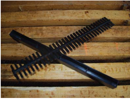
The 2 piece BeetleEater trap. Beetles try to hide from the bees by running into the holes on the sides of the top. The Cutts trap has the holes in the center. The value of this trap is that it is reusable.

about relying on this completely. Once in the past Bob had the opposite occur. Nothing worse than all your hard work ending up in the bellies of those beasts.