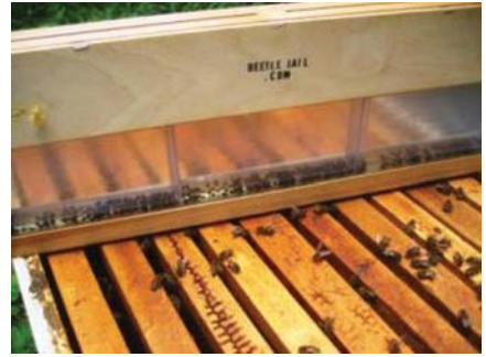
The Beetle Jail replaces a whole frame in a super or hive body. Beetles hide in the slot on top, fall into the container of oil below and drown. The clear plastic container simply slides out of the surrounding frame to be emptied and refilled. No spilling, and a huge capacity.

If you find a colony heavily infested with beetles don't combine it with one that's not. Suddenly increasing the SHB population may cause a strong colony to collapse. In our experience here at the lab, when we come across a colony loaded with beetles, we add traps (which I'll get to here in a minute) reduce the amount of space available, take any frames