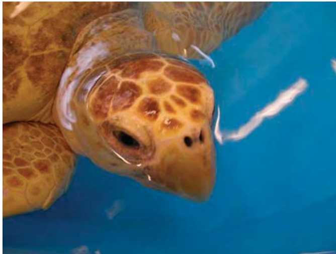
Injured sea turtle at the center.