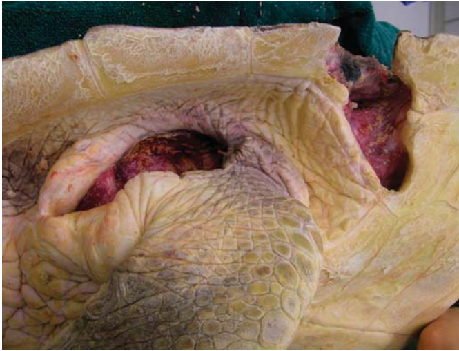
Duffy's wounds after being treated with honey.