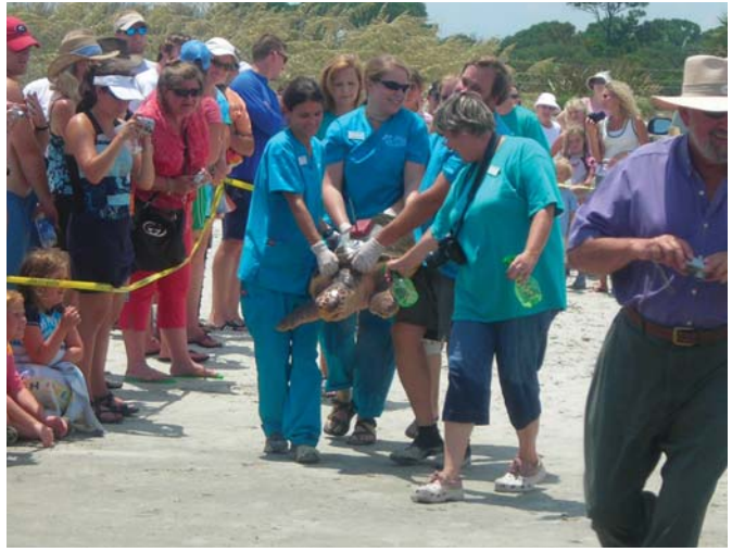
Rehabilitated turtle being released back into the ocean.

sorts of maladies in humans, including healing wounds. Honey inhibits the growth of most bacteria because it produces hydrogen peroxide when exposed to tissue. Here is a simplistic overview of the process. Honey by itself has a low pH of around four, so it's acidic. Depending on the floral type, honey averages about 30% glucose. While bees are ripening honey they add an enzyme, glucose oxidase, to the honey. This enzyme oxidizes glucose and forms gluconic acid. The acid formed aids in the stability of honey against fermentation. Also, for every molecule of glucose oxidized one molecule of hydrogen peroxide is formed. This too helps keep the honey from spoiling. When skin and body fluids are treated with honey the environment is just right for the glucose to break down and release hydrogen peroxide. These antibacterial properties from the creation of hydrogen peroxide help wounds heal faster. Remember that nasty cut your mother poured liquid into while you writhed in pain? More than likely it was hydrogen peroxide and it was killing all sorts of bacteria, which was a good thing even though it didn't seem like it at the time.