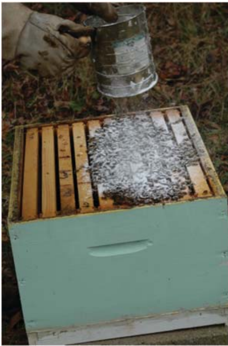
Dusting bees with powder sugar using a flour sifter.

non-treated controls (never treated with powdered sugar or any remedial action), raising the experiment to n=72 colonies. These colonies provided an additional treatment group for comparison in one-way ANOVAs against the simple effect of powdered sugar.