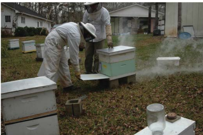
After dusting colonies with powder sugar, inserting sticky screens in order to count mite drop.

Our first question was simply whether Varroa mite levels were affected by powdered sugar treatment. To test this, we pooled all 64 colonies in the balanced experiment