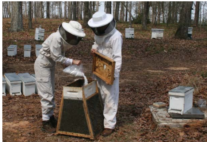
Dusting bees with powder sugar to dislodge mites.

As an appendage to this balanced design, we set up and managed an additional eight colonies as negative,