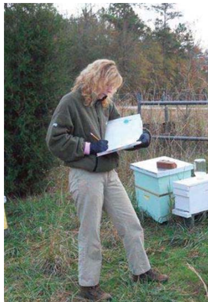
Evaluating colonies in early Fall.

current year is written on the top bar. This helps us to know when those frames were drawn. We keep an eye on the dates and cull frames after they’ve been in service for three years. We used to put the date on the frames as we built them, but that didn’t always work because some frames didn’t get used that year. Then, we would forget to scratch out the old dates. As testimony, I have frames of foundation in my bee barn with drawn comb dates of 2010, 2011, and 2012 that have still not been corrected. We have tried other methods, such as dating the frames once they’ve been drawn, but, on a busy day in the apiary, we tend to forget, not have a permanent marker, or not remember what year it is. Plus, top bars quickly accumulate waxy build up that often makes writing on them, after the fact, ineffective. But, it is a good practice to date frames – especially brood frames – so you know how old they are. Why do we use a three year window? Well, over time, wax comb sequesters all sorts of contaminants: pesticides, heavy metals, and fungal and disease spores. Plus, if the comb is used to rear brood, the cells become darker and smaller over time due to foot traffic, as well as fecal matter and cocoons deposited by developing larvae. If you’re interested in reading more about this, my masters research paper compared old comb to new comb: www.ent.uga.edu/bees/publications/effects_comb_age.pdf .