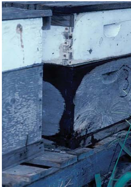
Figure 1 – Fermented honey foaming out of the colony.

Our job that day was to collect as many adult SHBs as possible. We had our handheld aspirators (Figure 3), which, after using for about 15 minutes or so made you feel like passing out. So, after thousands of beetles were sucked out of the hives, it was time to sex them (determine which beetles were males and which