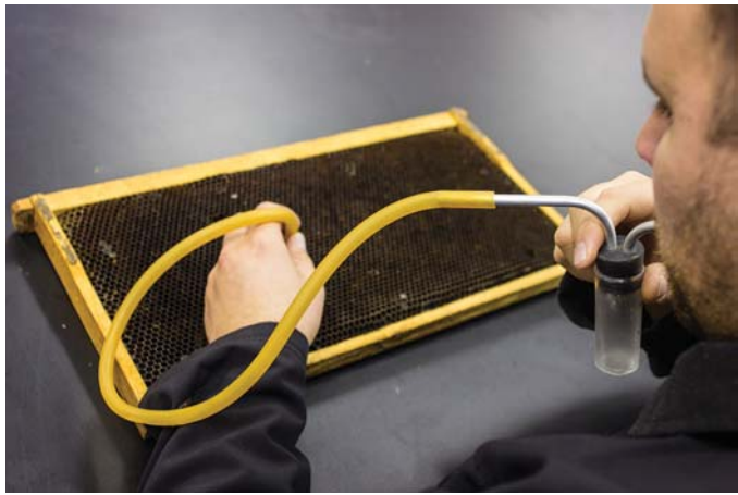
Hand held aspirators work well for sucking up SHBs.

underneath. That's when I noticed hundreds of white SHB larvae and pupae. WHAT? There shouldn't be any beetle issues here! We had just gone through the entire colony (actually, all the colonies in that apiary) and saw SHBs here and there, but not to a degree that concerned us. And this particular colony had been fine. No SHB larvae, good brood patterns, a healthy population – but the evidence was lying buried in the ground. The more I scratched, the more immature SHBs I found. This particular colony was even in full sun most of the day, but the surface underneath the colony, in between the two blocks, was moist, dark, and nutrient rich with hive debris constantly dropping down from above. We moved a few more colonies, and, sure enough, MORE BEETLES!