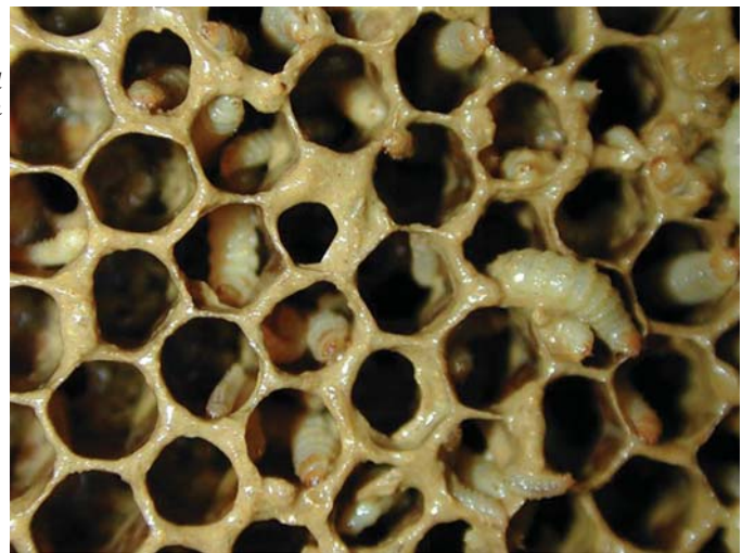
Figure 2 – Slimed wax comb from SHB activity.

Over time, SHBs not only take over colonies, but they also become permanent residents in our apiaries. It may take years, but it can happen – especially in moist, rich or sandy Southern soils. This past year, we had a colony that was leaning too far to the right. To keep it from tipping over, we moved it a few feet onto more level ground. As I was relocating the blocks that the hive was situated on, I disturbed the soil