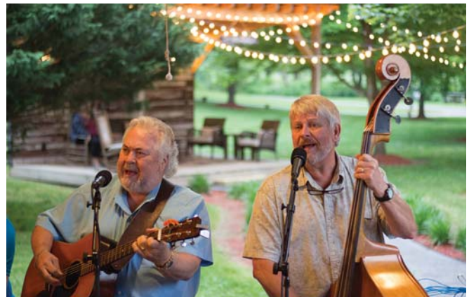
Blue grass musicians entertaining the crowd.