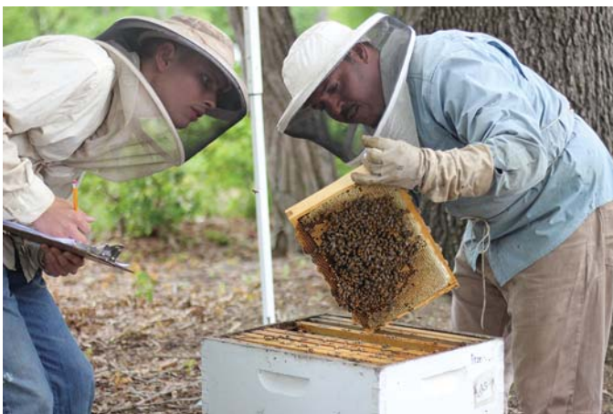
UGA Lab Technician questioning a potential certified beekeeper during the practical exam.